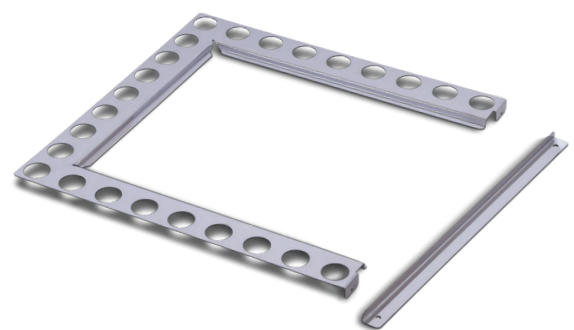
SS3195 stainless steel bracket is a required installation kit to install the DWU05 flush to the underside of a bench.

The DWU05 installed with a marble counter top