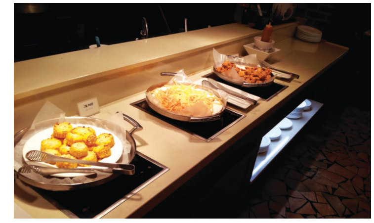
Multiple DWR04's installed with stainless steel trim in a buffet counter