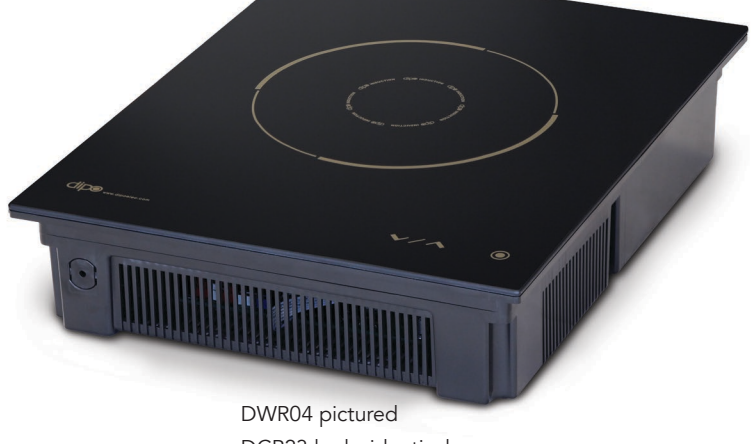
DCR23 looks identical