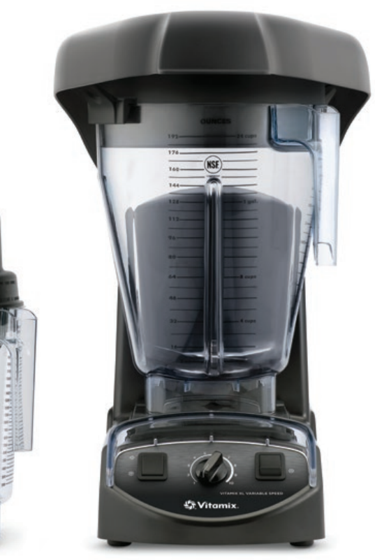
VM57556 with 5.6 Litre XL Container