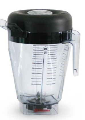
5.6 Litre XL Container