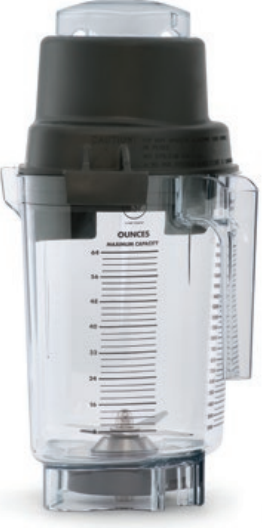
Optional 2.0 Litre XL Container