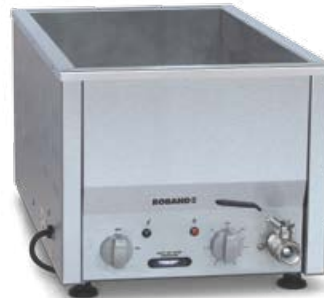
BM21 pictured. (narrow footprint)