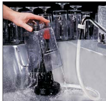
Rinse-o-matic in action.