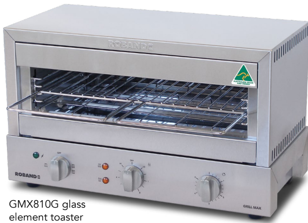
GMX810G glass element toaster