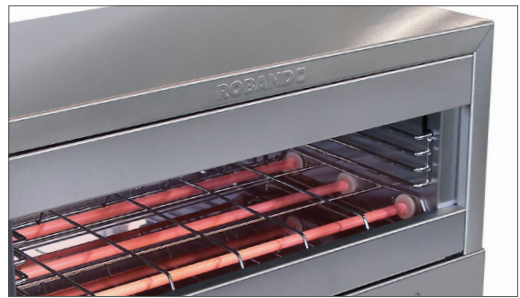
Glass element toaster showing elements operating