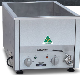
BM21 (narrow footprint)