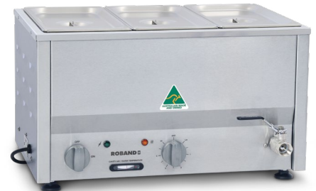
BM2B (wide footprint)