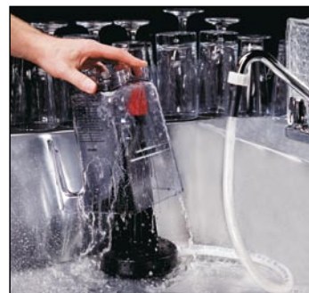
Rinse-o-matic in action.